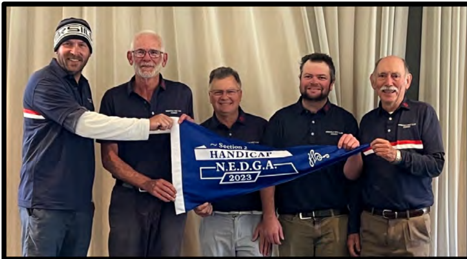
DIVISION 2 PENNANT TEAM