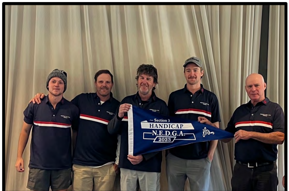
DIVISION 3 PENNANT TEAM