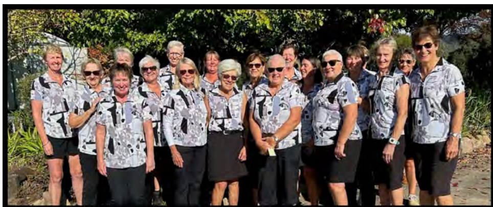
Ladies Division 1 & Division 4 Pennant Players & Caddies